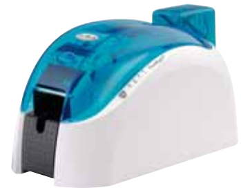
VB-P408DBL Double sided card printing