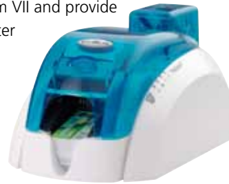
VB-P408 Single sided card printing

Adding impressive employee, student or visitor badges has never been easier with Keyscan's line of card printers. These printers provide guaranteed integration with System VII and provide the highest quality, durable graphics printing available from a printer of its size. Conveniently place the small footprint Evolis or Dualys printers on any workstation or desk. Its quiet operation will surely be appreciated by the operator. Use this printer with any standard ISO printable card and add an additional layer of security with Keyscan's Photo-badging software module (K-BADGE).